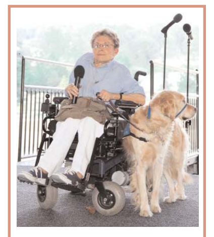
"The Most Remarkable Woman I Know"

The risk of developing pressure ulcers, also called bedsores or pressure sores, is ever present for people who spend their days in a wheelchair or in bed. They are caused by sitting or lying in one position for too long, which puts pressure on certain areas of the body. This pressure cuts off blood supply to that area and can cause the skin and underlying tissue to die, which leads to the formation of a pressure sore.